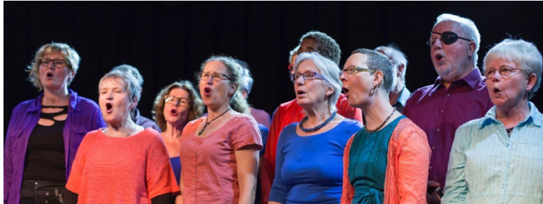
Singing for Your Life Choir in The Netherlands.

in 1997. Since then this organization has been initiating exhibitions, ateliers, art, drama and writing courses, choirs and research throughout The Netherlands. 15